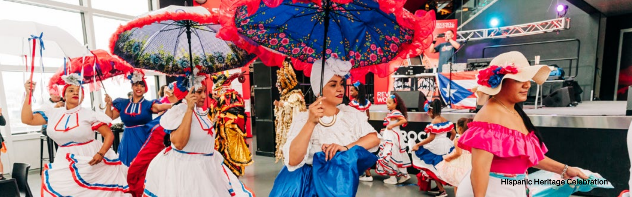
Hispanic Heritage Celebration