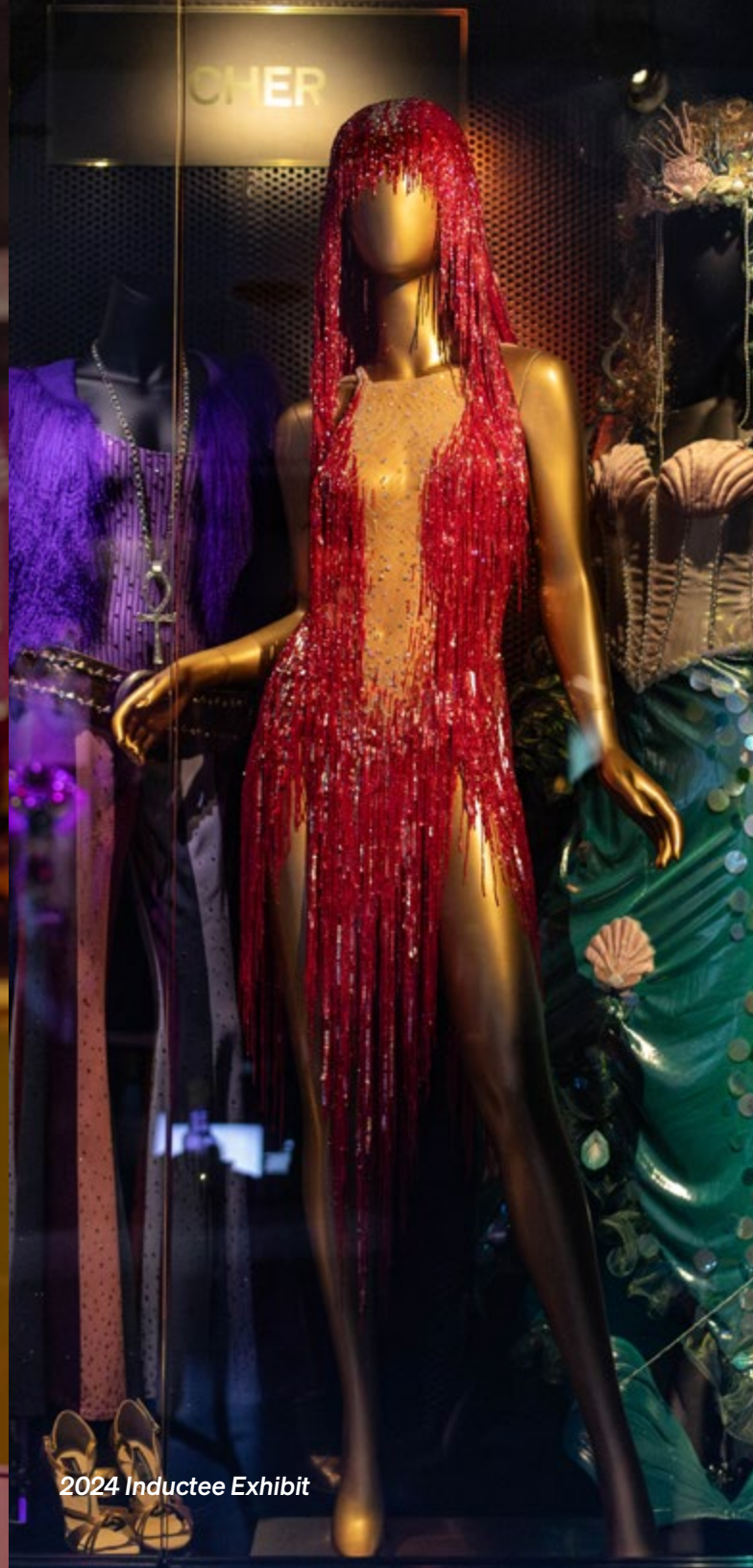
2024 Inductee Exhibit

2024 boasted an impressive exhibit line-up, as we opened eight exhibits and installed over 720 individual artifacts, telling the stories of incredible, diverse people who contributed to the creation and evolution of rock & roll.