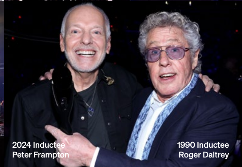
2024 Inductee Peter Frampton