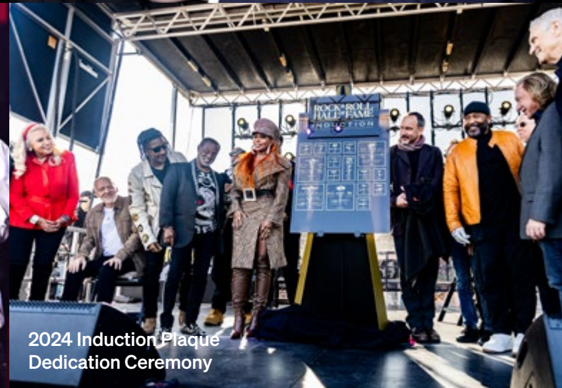
2024 Induction Plaque Dedication Ceremony