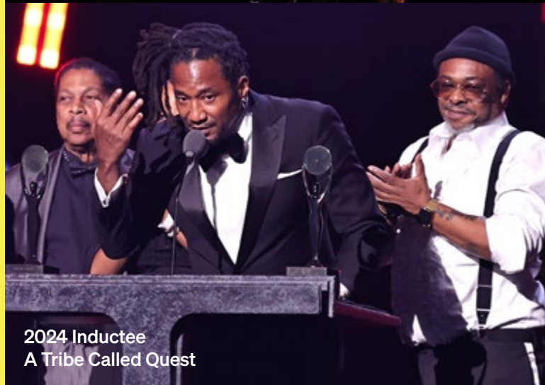
2024 Inductee A Tribe Called Quest