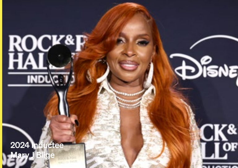
2024 Inductee Mary J Blige

MARY J BLIGE JIMMY BUFFETT CHER DAVE MATTHEWS BAND FOREIGNER PETER FRAMPTON KOOL & THE GANG ALEXIS KORNER JOHN MAYALL MC5 OZZY OSBOURNE SUZANNE DE PASSE BIG MAMA THORNTON A TRIBE CALLED QUEST DIONNE WARWICK NORMAN WHITFIELD