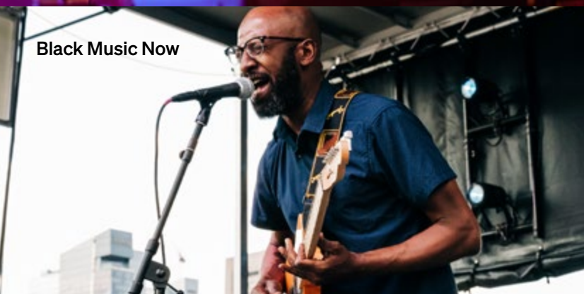
Black Music Now

Over the past few years, we have made great strides in the Rock Hall intern experience. In 2024 we brought on 32 interns, as well as three up and coming musicians for the Artists in Residence program in partnership with The Kulas Foundation. The students we bring on board are able to dive deep into projects that support their department's work and are provided with a comprehensive learning environment and professional development opportunities. All interns are able to participate in staff panel discussions, leadership sessions with the Rock Hall executive team, and summer programs at the museum and around Cleveland. This outstanding effort has generated a high demand for the program and presented a mutually beneficial experience for both students and staff.