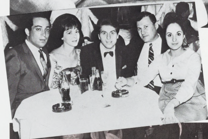
Elvis Presley with Col. Tom Parker