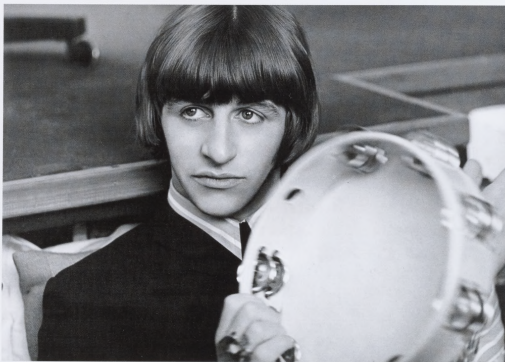
When he was Fab, 1964

To the average Beatles fan, technical talk about Ringo's stickwork and setup is beside the point. What matters is how seamlessly he wove his drumming into the band's songs, energetically propelling the fast ones (such as "She Loves You" and "Can't Buy Me Love") and providing decorative fills and rolling thunder on their more ornate works (such as "Tomorrow Never Knows," "Lucy in the Sky With Diamonds," and the Ringo-sung "Yellow Submarine").