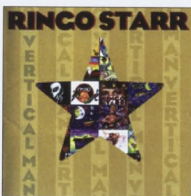
VERTICAL MAN Mercury 1998