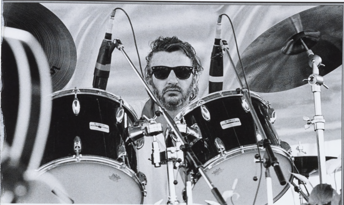
Still behind the drum kit

for 37 weeks. Ringo was now a solo star.