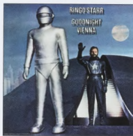
GOODNIGHT VIENNA Apple 1974