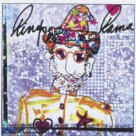
RINGO RAMA Koch 2003