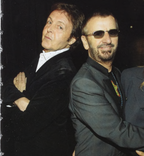
CLOCKWISE FROM TOP LEFT Ringo as a teenage teddy boy in Liverpool, circa 1959; playing his signature style with the Beatles in Milan, 1965; with wife Barbara Bach, 1981; at the Beatles' Rock and Roll Hall of Fame induction, with George Harrison, Yoko Ono, and Julian and Sean Lennon (from left), 1988; with Paul McCartney, 2006.