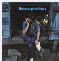
BEAUCOUPS OF BLUES Apple 1970