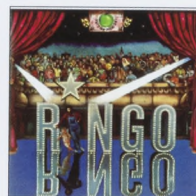
RINGO Apple 1973