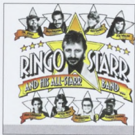
RINGO STARR AND HIS ALL-STARR BAND EMI 1990