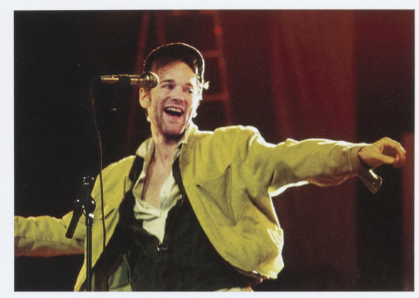
Stipe demonstrating how to twirl

From that illustrious start through the early nineties, R.E.M. reigned as what Buck once termed "the acceptable