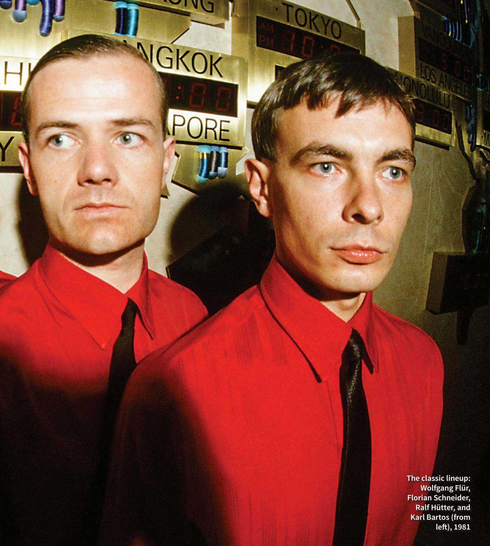
The classic lineup: Wolfgang Flür, Florian Schneider, Ralf Hütter, and Karl Bartos (from left), 1981