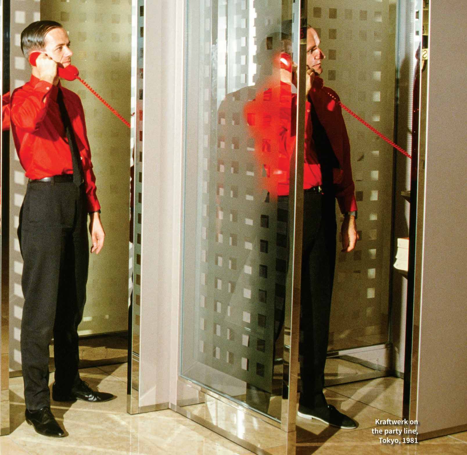
Kraftwerk on the party line, Tokyo, 1981

and a Polymoog. By the 1981 tour for Computer World , Kraftwerk had turned their complete Kling Klang studio into road-friendly electronic modules that could be assembled onstage. Shows concluded with Hütter, Schneider, Flür, and Bartos exiting the stage, leaving robots to play the final song. What the band called “robot pop” garnered celebratory, ecstatic responses from audiences reveling in an imagined future.