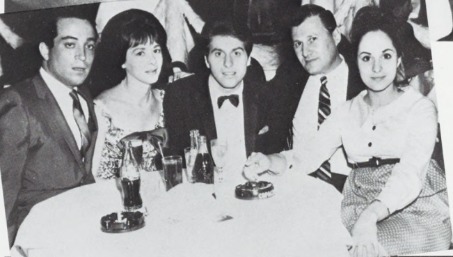
Elvis Presley with Col. Tom Parker