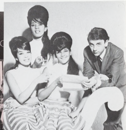
Phil Spector with the Ronettes