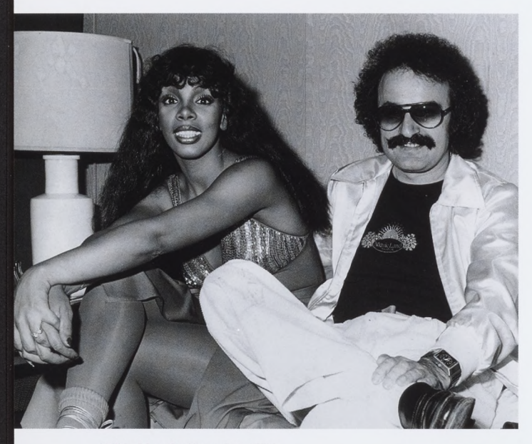
With Giorgio Moroder, 1976