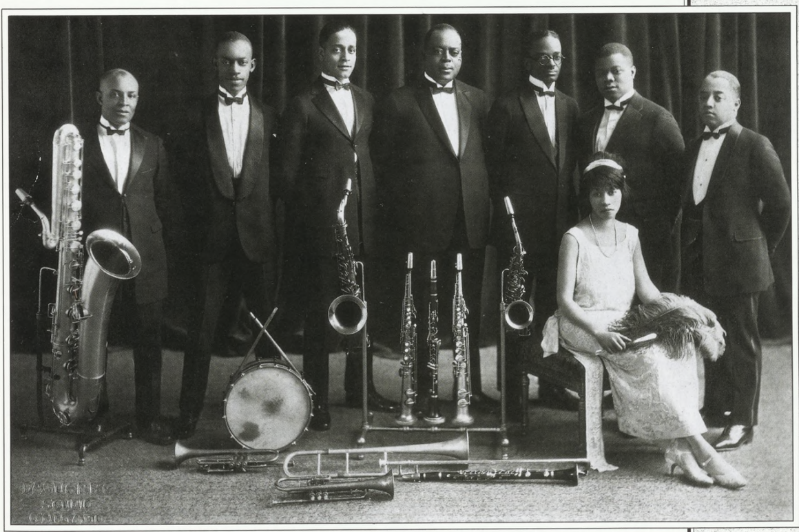
King Oliver's Creole Jazz Band of 1924 featured the young cornetist Louis Armstrong, second from right.