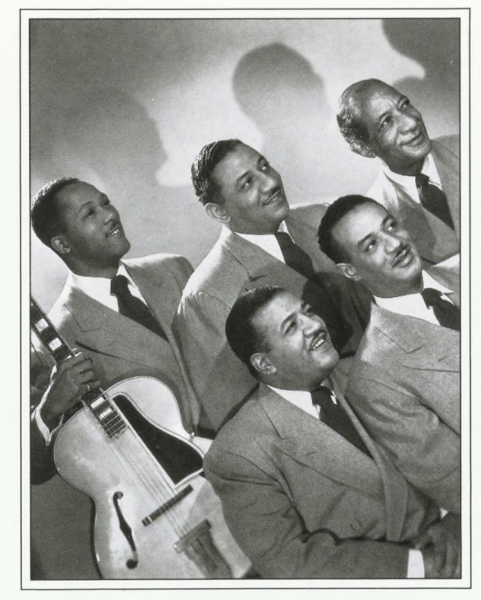
In the Thirties the Mills Brothers were superstars; Brunswick paid them a fee of $500 for every record.

Many other vocal groups soon filled the dial with fifteen-minute spots every day of the week, but the Mills Brothers quickly achieved superstar status. Under the skillful guidance of Tommy