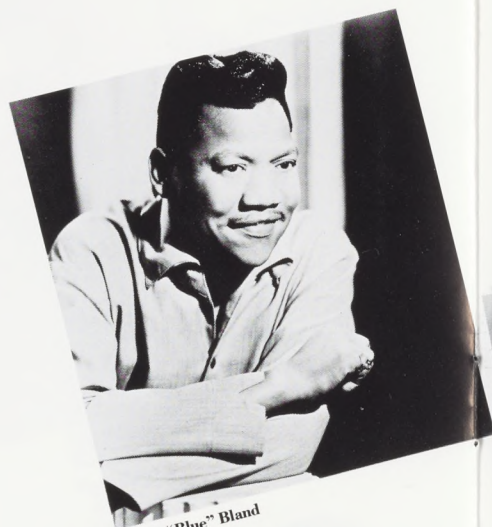
Bobby "Blue" Bland

Although Holly's rock and roll career was brief, it yielded a wealth of material. His "Words of Love" would help launch the Beatles (whose very name was an homage to the Crickets), and "Not Fade Away" would provide the Stones with their first Top Ten hit. Moreover, Holly's approach suggested the shape of rock and roll to come. He wrote his own material, took advantage of studio technology and employed the now-classic two guitars, bass and drums lineup. In a short span of time, Buddy Holly created something timeless.