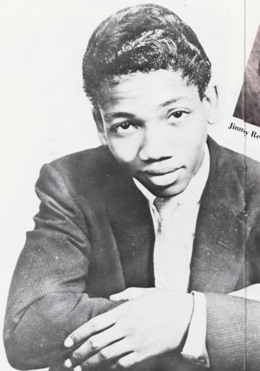
Little Willie John