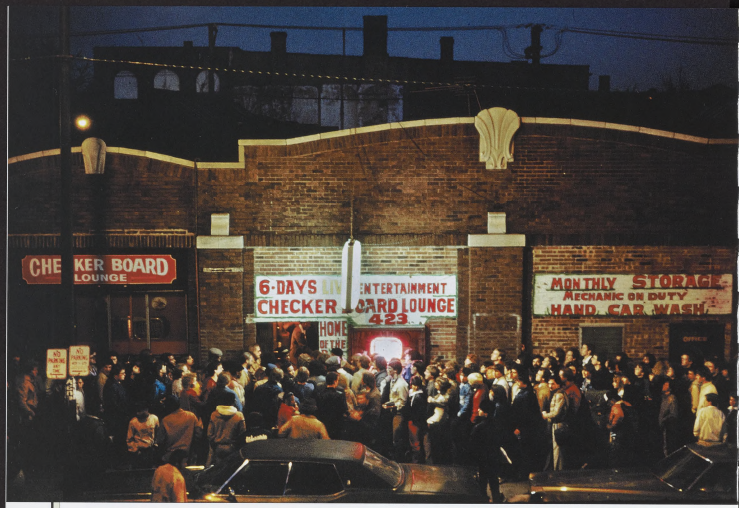
▲ Buddy Guy's Checkerboard Lounge in Chicago, on the night of Muddy Waters's funeral, 1983, after word got out the Stones might stop by